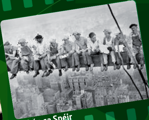
Lón sa Spéir