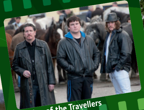
King of the Travellers

The Broadcasting Authority of Ireland is pleased to support the International Association for Media and Communication Research (IAMCR) 2013 Conference